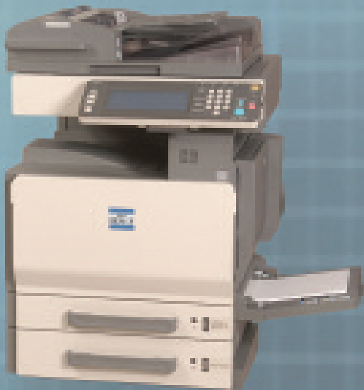
Base Unit + Duplex Document Feeder

Instantly provide full color for your business that's fast, cost effective, centrally managed, networked, and easy to use.