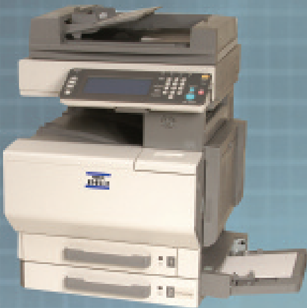
Base Unit + Duplex Document Feeder

Instantly provide full color for your business that's fast, cost effective, centrally managed, networked, and easy to use.