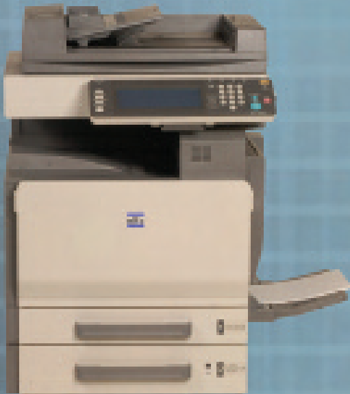
Base Unit + Automatic Document Feeder

Instantly provide full color for your business that's fast, cost effective, centrally managed, networked, and easy to use.